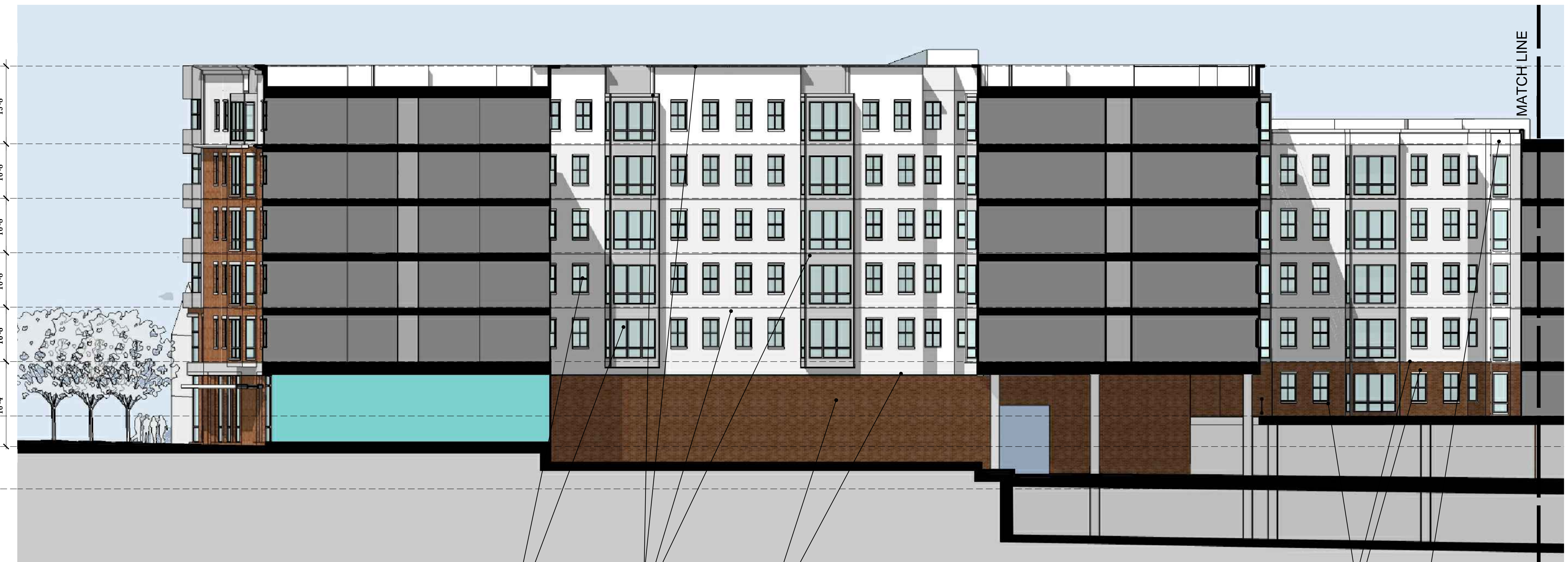
elev 1A NORTH ELEVATION 3/32"=1'-0" A5.03 COURTYARDS

T.O. PARAPET 15'-8" 141.33 LEVEL 6 10'-8" 129.66 LEVEL 5 10'-8" 119.00 LEVEL 4 10'-8" 108.33 LEVEL 3 10'-8" 96.67 LEVEL 2 74'-4" 86.00 16'-4" 80.00 GROUND LEVEL 71.00