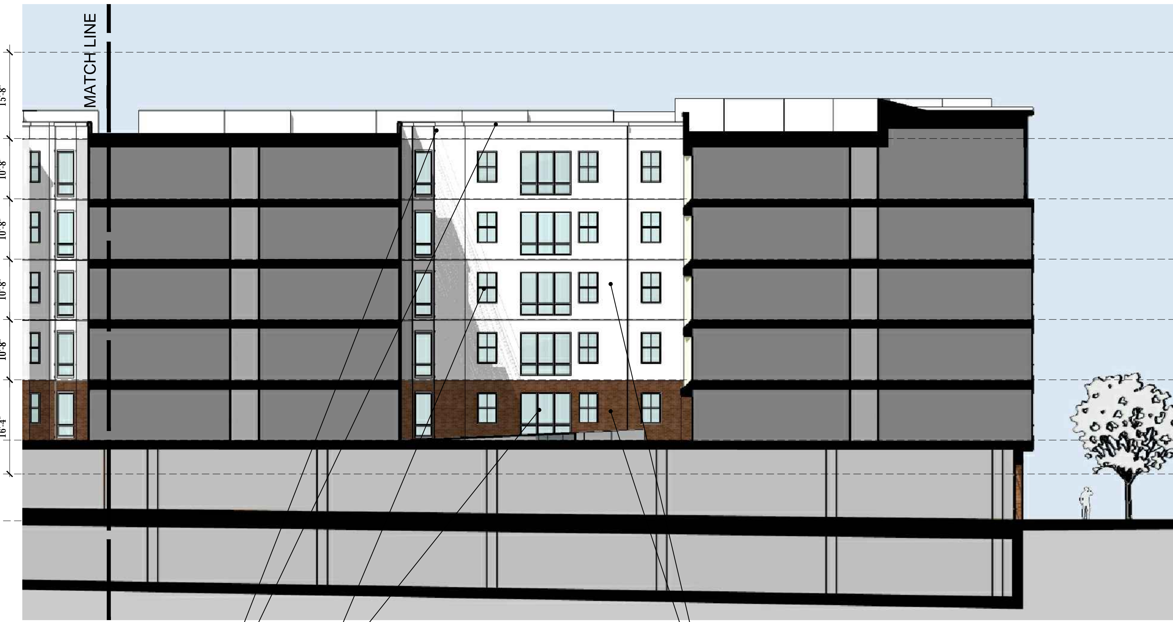
elev 1B NORTH ELEVATION 3/32"=1'-0" A5.03 COURTYARDS, CONT.

T.O. PARAPET 15'-8" 141.33 LEVEL 6 10'-8" 129.66 LEVEL 5 10'-8" 119.00 LEVEL 4 10'-8" 108.33 LEVEL 3 10'-8" 96.67 LEVEL 2 74'-4" 86.00 16'-4" 80.00 GROUND LEVEL 71.00